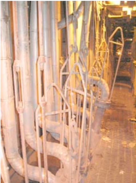
Photo 3 - Post incident damage. Note displaced hangers and counter weights