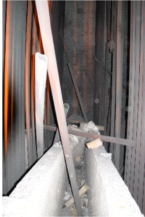
Photo 6 - Internal condition of radiant section