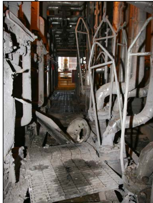
Photo 4 - External damage