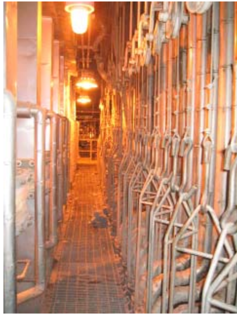
Photo 2 - Pre incident general radiant tube arrangement