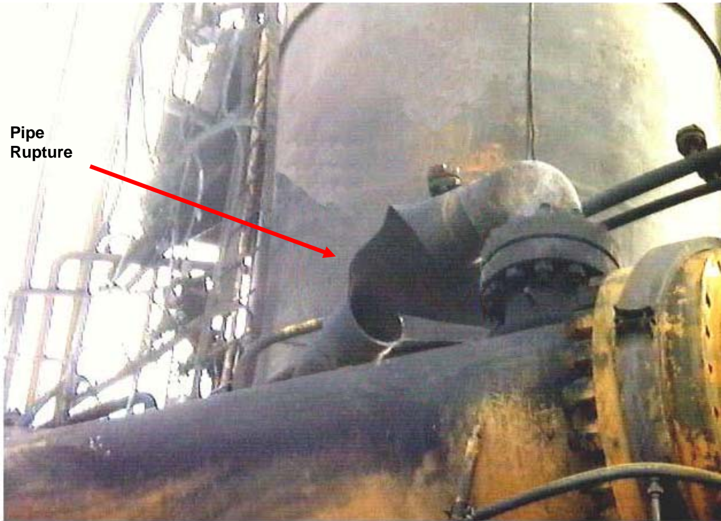
Figure 4 – Effluent Pipe Rupture Seen From Back Side of Reactor