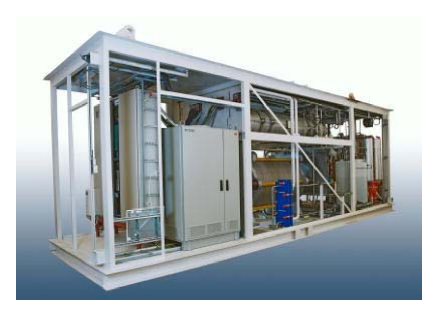
Figure 2. Hydro water electrolyser container without panels