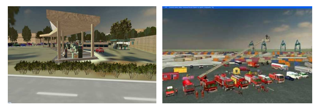
Figure 5. Virtual refuelling station and Fire Trucks developed for ENSOSP.

The VR training exercises will be performed on the hydrogen VR training platform. 3D representations of each FCH system and infrastructures including passenger vehicles, buses, forklift, refuelling station, decentralised hydrogen production, storage and distribution systems, backup power generation, stationary fuel cells for combined production of heat and power (CHP) will be created. All the modelled FCH systems and infrastructures will be integrated within the virtual department of ENSOSP (EVE urban, port and industrial site).