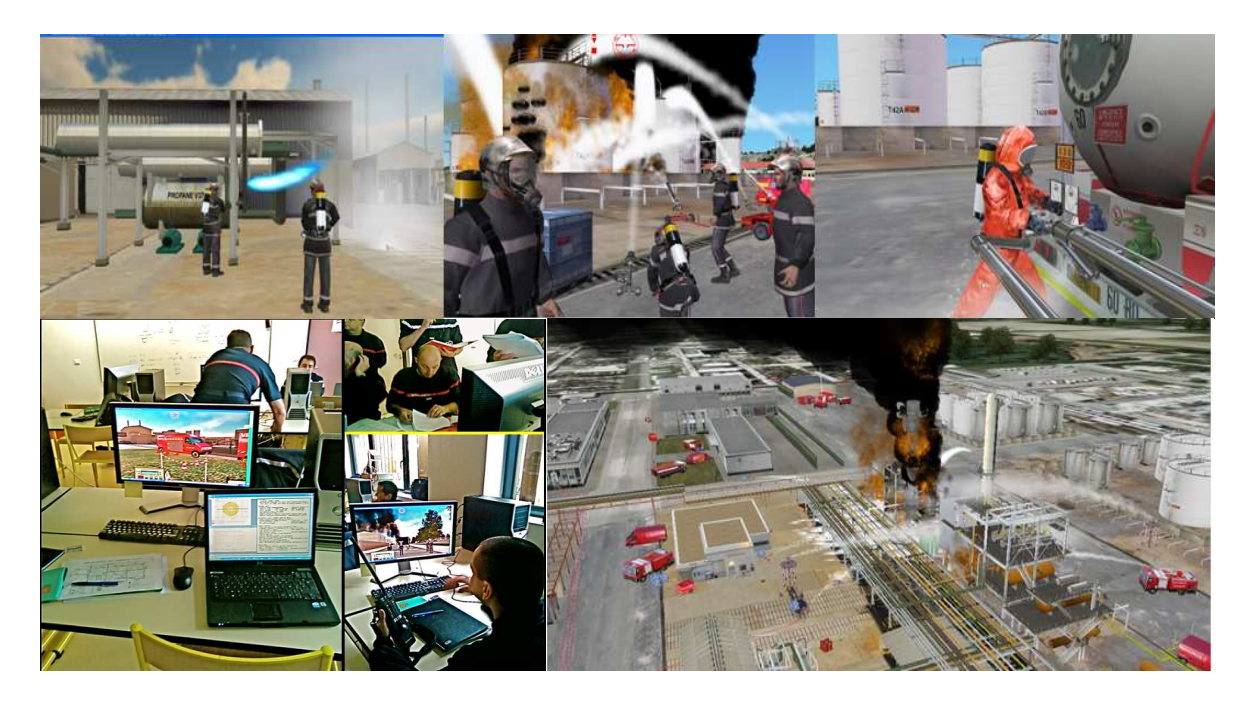
Figure 4. Snapshots of 3D Virtual Reality Serious Game training at ENSOSP's virtual facility.

In France, fire-fighters use virtual reality to train their teams in virtual environments to face specific risks such as radiological, nuclear or chemical in an interactive use and in real time for different sites such as classified SEVESO (chemical risk), port, airports... International training sessions have been held between French, US and Australian fire fighters for HRO and doctrine comparison studies, international training sessions are regularly held for practicing international cooperation, typically like wildfires going to/from France to Spain or Italy. On these aspects, the VR simulator and the experience of CRISE, will be valuable to fulfil the objective of the project to train simultaneously first-responders from different European countries.