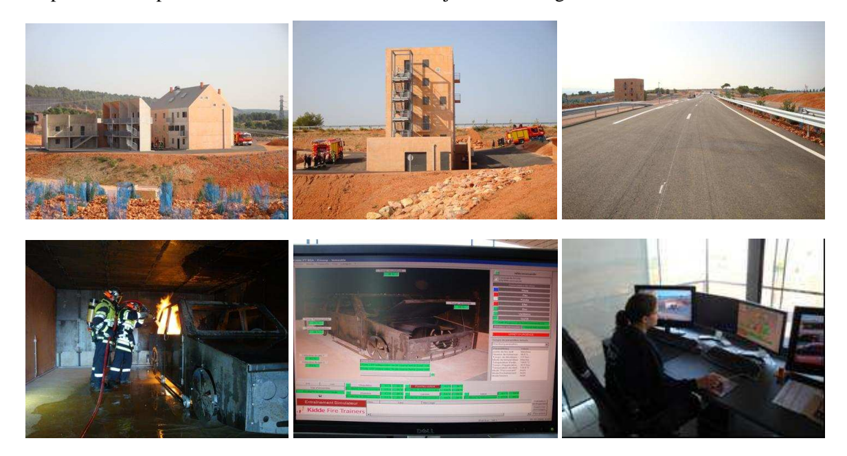
Figure 2. Photos of ENSOSP's operational training facilities.

Full scale training exercises will take place on the existing highway and road portions for car accident scene and potentially residential area. To complete the range of training exercises, it is planned to build a hydrogen-dedicated training facility that will include a mock-up hydrogen refuelling station, hydrogen passenger vehicle, a hydrogen-based energy storage system coupled with photovoltaic panels installed on the roof of an adjacent building.