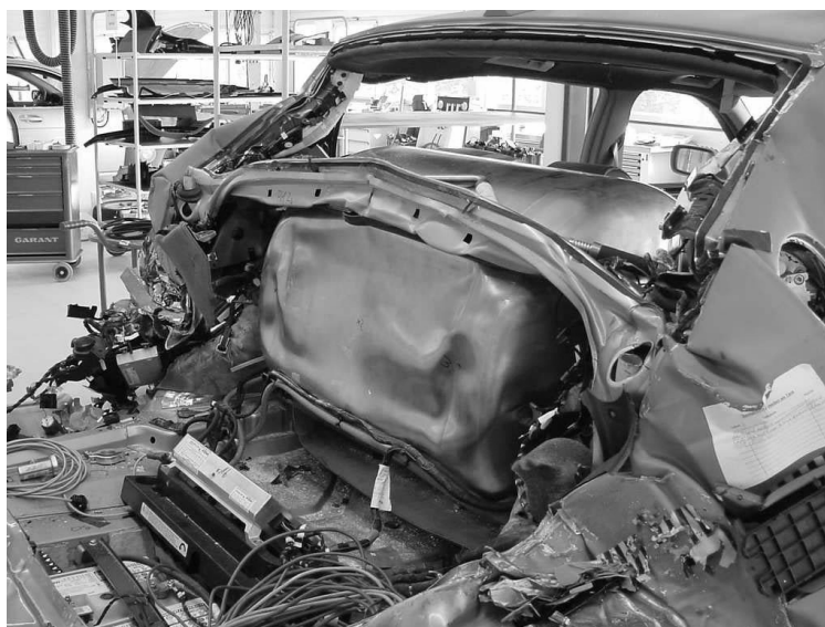
Figure 5: Crash test truck override

The second extreme test was a rear crash test truck override at EES (Energy Equivalent Speed) of 45 km/h (Fig. 5). The mobile barrier, especially constructed for this test, crossed the longitudinal carriers of the Hydrogen 7 at a height of 700 mm and distorted the LH 2 -tank. The result turned out well, as the safety system closed the tank valves and the tank remained intact despite its distortion. Even the tank vacuum was in order after the test. During all crash tests, the guidelines were met or exceeded [4].