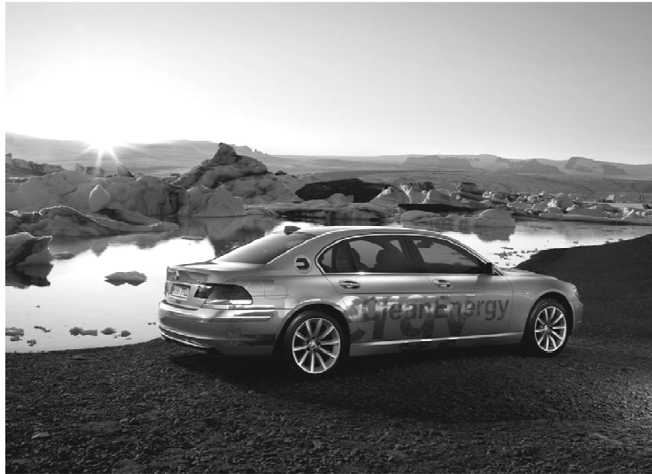
Figure 1: Hydrogen 7

The Hydrogen 7 is based on the long-wheelbase version of the current BMW 7 Series model. There are scarcely any visible changes to the body, but a number of components have been newly developed on account of the vehicle's higher weight and the need to handle the hydrogen fuel (Fig. 1). The super-insulated liquefied hydrogen tank is entirely new, as are several weight-optimized body areas of composite construction using carbon-fibre reinforced plastic (CRP) and steel [1].