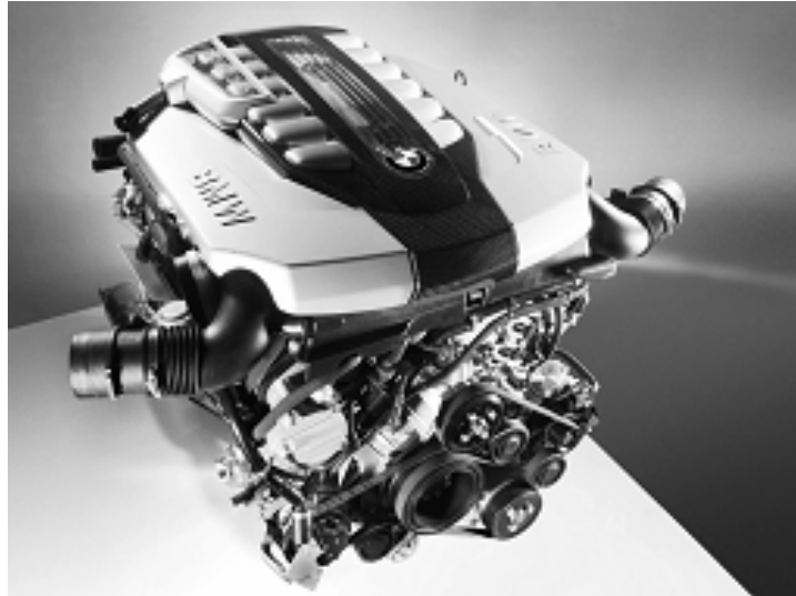
Figure 2: Bi-fuel internal combustion engine

The bi-fuel power train concept calls for two separate fuel storage systems to be integrated into the car. As well as the 74-litre petrol tank, there is a LH 2 tank capable of holding about 8 kilograms of liquefied hydrogen (Fig. 3). BMW has adopted hydrogen in liquefied form, because LH 2 storage systems have the highest volumetric and gravimetric energy densities compared to gaseous hydrogen, which is stored at high pressure [2]. This increases the range for a given storage volume. The tank system is a major challenge, because hydrogen liquefies only at the extremely low temperature of -253°C, and this low temperature must be maintained in the tank for as long as possible. In order to achieve this, the double-walled tank is equipped with vacuum super insulation (Table 1).